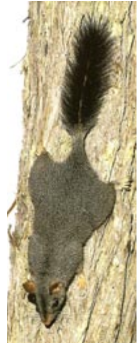
The Phascogale

Tuans are listed as threatened at both a State and National level.