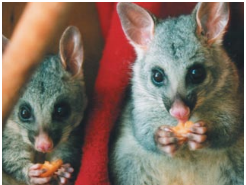
Possums in care at Hepburn Wildlife Shelter

No animal is fed from a human hand nor are they given 'human' foods such as bread or cooked meats. This is to reduce the chances of released animals