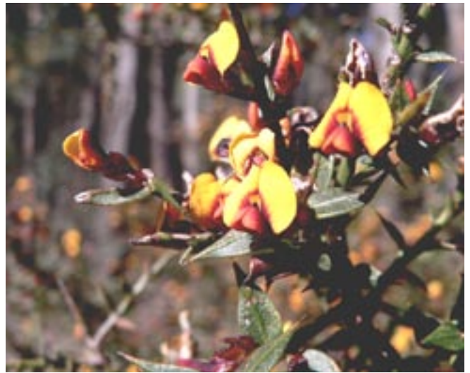
Gorse Bitter-pea ( Daviesia ulicifolia )

As the name implies the understorey contains a variety of shrubs. Often this shrub layer is quite open and scattered, although in some areas it can be quite dense. The most common medium-sized shrub species are Prickly Moses ( Acacia verticillata ) and Narrow-leaf Wattle ( Acacia mucronata ). Other medium-sized shrubs that may be present include Large Leaf Bush-pea ( Pultenaea daphnoides ), Prickly Tea-tree ( Leptospermum continentale ), Common Cassinia ( Cassinia aculeata ) and Hop Goodenia ( Goodenia ovata ). Smaller shrubs include Gorse Bitter-pea ( Daviesia ulicifolia ), Common Heath ( Epacaris impressa ), Moth Daisy-bush ( Olearia erubescens ) and Wombat Bush-pea ( Pultenaea reflexifolia ).