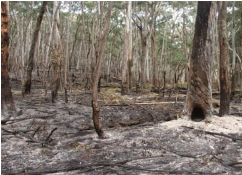
Fire Effects Study Area at Kangaroo Creek