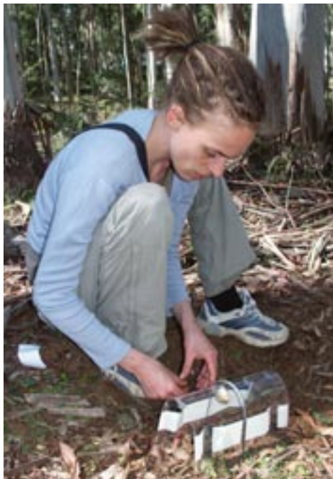
Ground hair tube placed by project volunteer

sided tape and a food source which attracts the animals. Hairs are left on the tape, and are examined microscopically for identification.